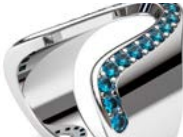
Free stone setting