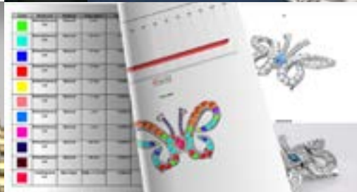
Stone inventory and stock + library