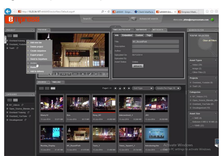
Figure 1 depicts the Empress eMAM user interface.

Empress eMAM is a powerful media asset management platform designed to organize, tag, search, collaborate, approve, distribute and archive digital content. Empress eMAM environment is used as part of the growing Adobe Anywhere ecosystem to manage, which is all designed to enable total content lifecycle management, from tracking source assets through production all the way to archive. Adobe Anywhere directly and simply integrates with eMAM to create custom workflows via the Anywhere API to allow users to easily manage all of their digital assets from any global location. It supports any type of digital assets; video, audio, image and documents. It powers search, browse and other media asset management tools by sharing proxy copies. It can also manage storage and processing across multiple locations. eMAM provides an intuitive web interface to quickly collaborate and share content using proxy copies.