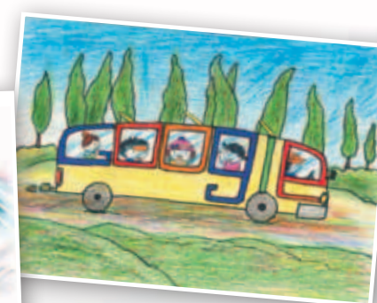
National Winner China 2012