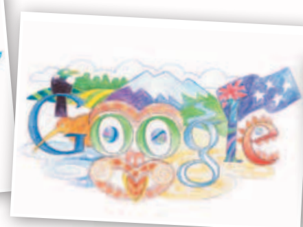
National Winner New Zealand 2011