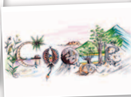
National Winner Australia 2011