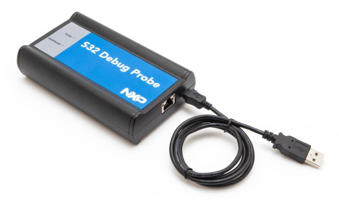
Figure 5. S32 Debug Probe with USB cable attached

1. Connect the other end of the USB cable to the USB connector of the S32 Debug Probe.