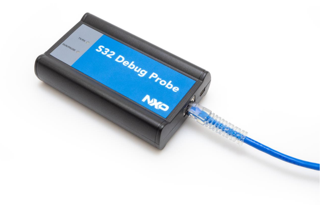
Figure 4. S32 Debug Probe with an RJ45 cable attached

2 Connect the other end of the RJ45 cable into the RJ45 connector of the Ethernet network or host computer.