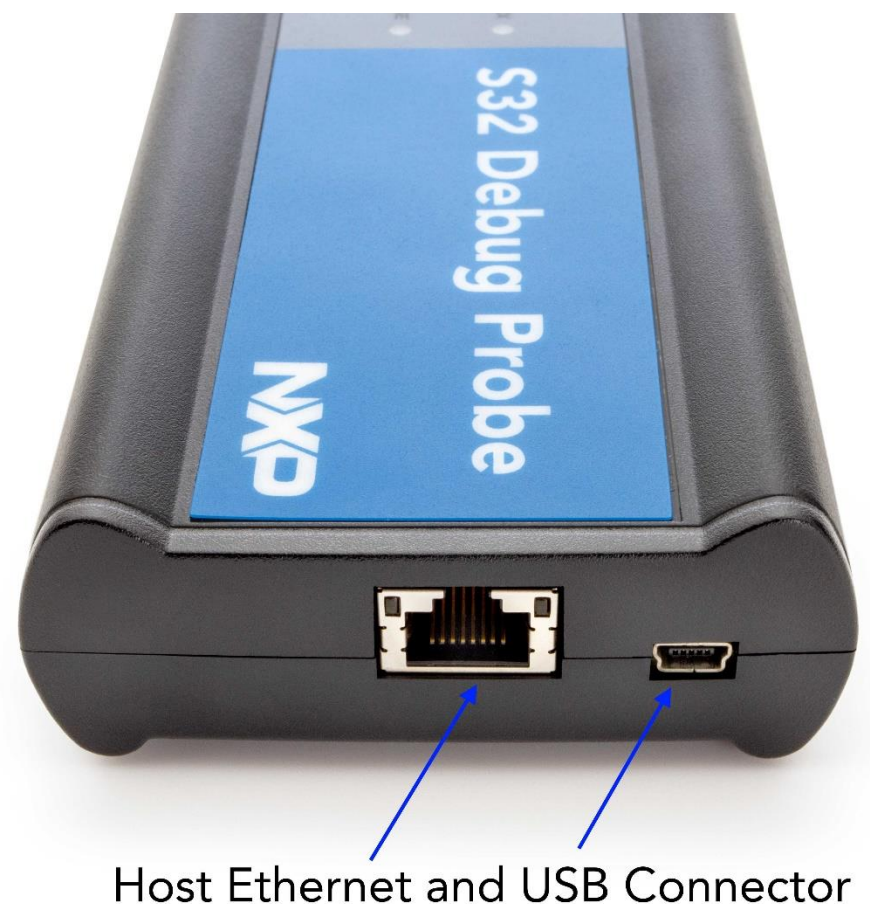
most Ethernet and USB Connector

The figure below shows the host connectors of the S32 Debug Probe.