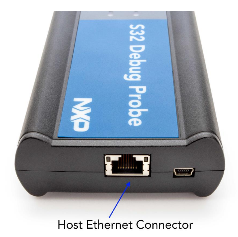
Figure 3. S32 Debug Probe with Ethernet connector

1. Plug one end of the supplied RJ45 cable (p/n 600-75499) into the RJ45 connector of the S32 Debug Probe.