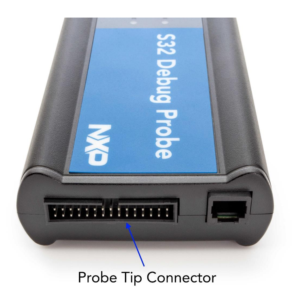
Figure 13. S32 Debug Probe - target side view

The figure below shows the target connectors of the S32 Debug Probe.