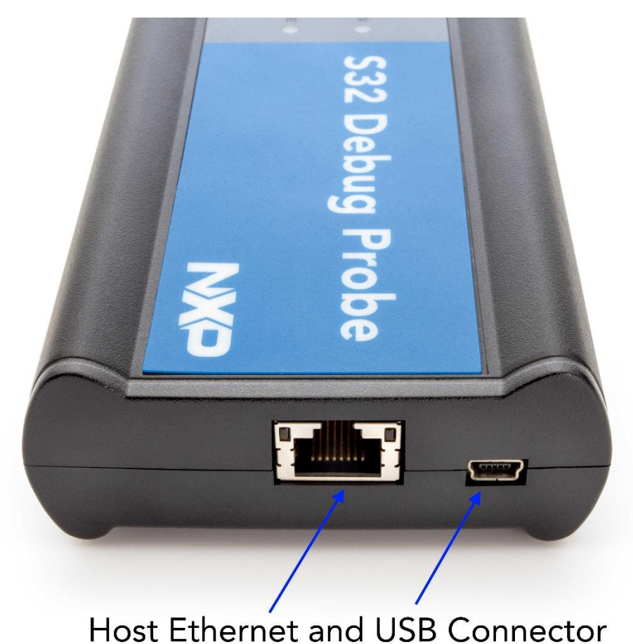
Figure 11. S32 Debug Probe - Ethernet and USB connector