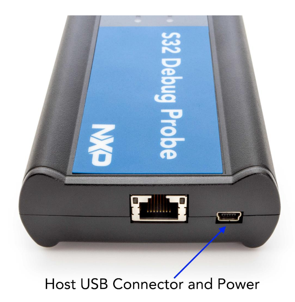
Figure 2. S32 Debug Probe with USB connector