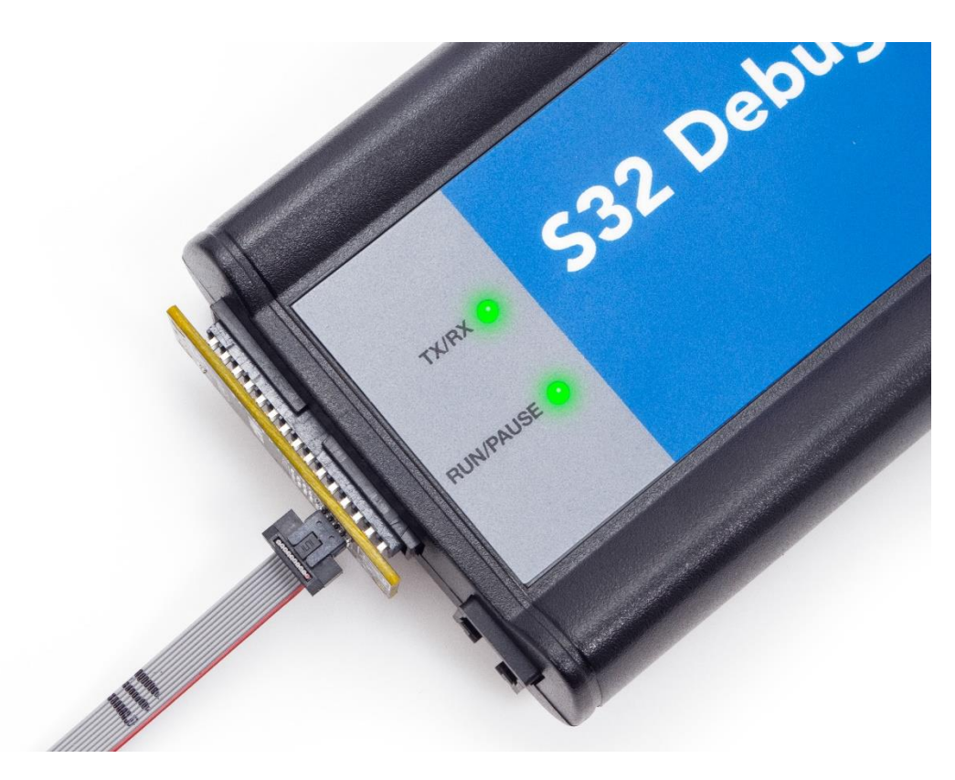
Figure 10. S32 Debug Probe - LED indicators

The figure below shows the various LEDs of the S32 Debug Probe.