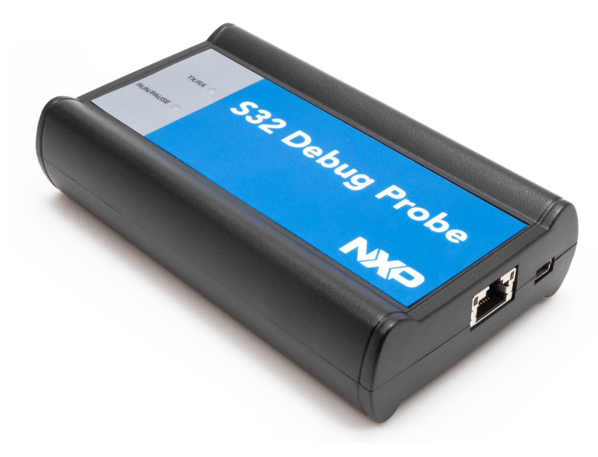
Figure 1. S32 Debug Probe