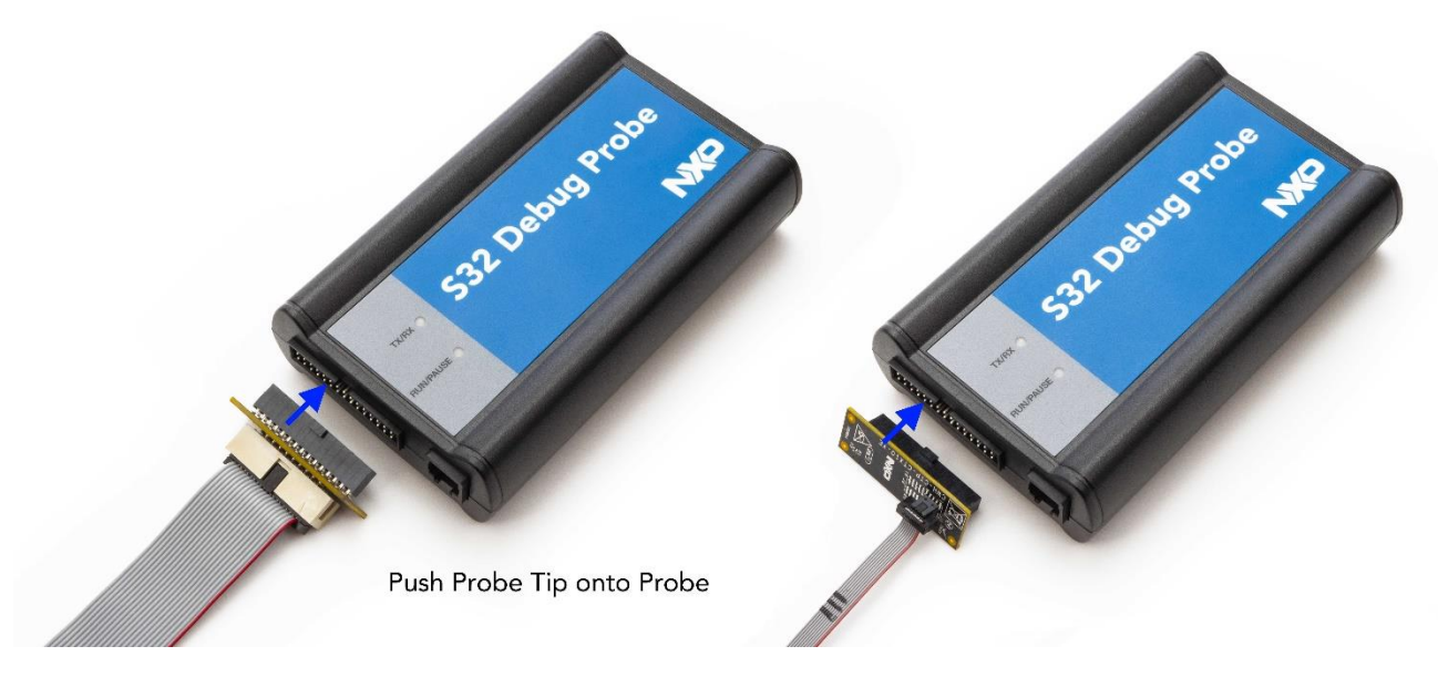
Figure 6. S32 Debug Probe - connecting probe tip to the probe

NOTE Pin 1 is clearly marked on the gray ribbon cable by a red line down one side of the cable and a small triangle in the plastic socket.