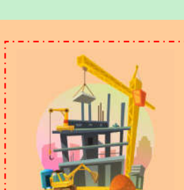
BROW0001 Brown Construction Non-Individual

Clients are viewed using the Clients Detail screen.