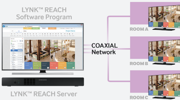
Figure 1. LYNK REACH solution diagram

LYNK™ REACH is designed exclusively to help hospitality businesses remotely, centrally and cost efficiently manage in-room displays. LYNK REACH is an server and software solution for hospitality environments that provides a simplified UI and editing tool. The software solution organizes and displays content, such as hotel information, images and logos and rich content including flight information, weather information and advertisement, using existing coaxial infrastructure. In addition, LYNK REACH improves usability by enabling hotel managers to edit channels and to monitor room status, recent deployment and activity. The solution also provides a simple, easy and intuitive user interface (UI) through Content Creator.