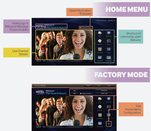
Figure 2. Enhanced Home Menu enables convenient delivery of useful information, while supporting hotel branding

The customizable Home Menu reduces the cost burden for hotels with consumer TVs that would otherwise have to adopt solution-embedded Hospitality TVs. With the Home Menu, these hotels can move forward from conventional consumer TVs to solution-based Hospitality TVs without incurring a huge expense.