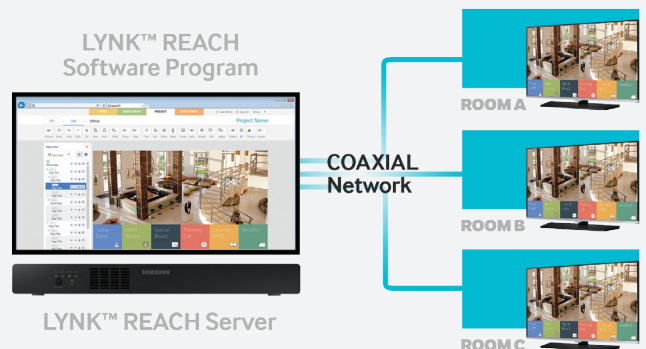
Figure 3. LYNK REACH offers a flexible and low-cost coaxial infrastructure Hospitality TV solution