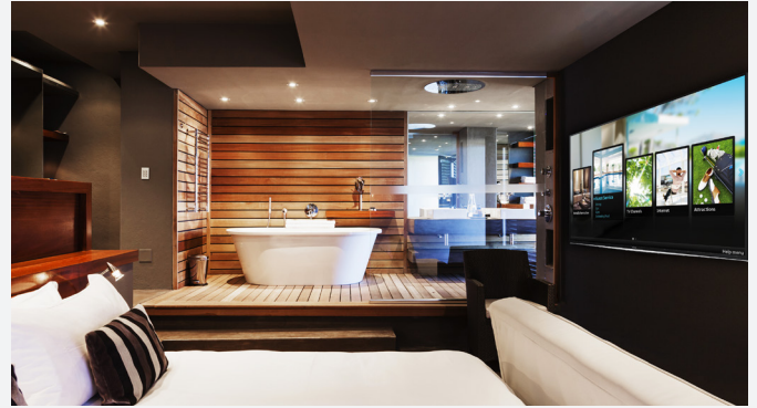
Figure 1. Samsung SMART hospitality displays upscale hotel suite atmosphere

Samsung SMART Hospitality Displays are integrated, high-performing TVs that include many desirable features and an interface designed for ease of use. The displays create a stylish room ambiance and provide a superior viewing experience in a streamlined design. They deliver myriad entertainment options for guests through smart connectivity features. To enhance the hotel's brand, staff members can customize welcome menus with a straightforward interface. Additionally, hotels can stay on budget with affordable content-streaming options and other cost-saving features.