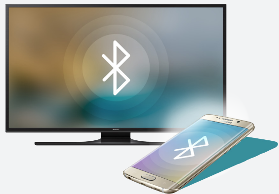
Figure 5. Bluetooth Music Player (Mobile to TV)

Bluetooth Music Player, which is included in HD690, provides a cozy, home-like atmosphere by enabling guests to listen to their mobile device audio through an easy connection. The Bluetooth Music Player feature eliminates the need for hotels to purchase additional costly audio docking stations that can easily be broken or stolen.