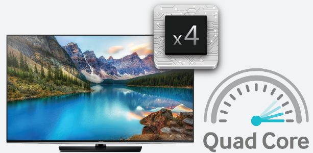
Figure 7. Quad Core processor enables smoother and faster TV performance

With a Quad Core processor, guests can experience smoother navigation and faster access to smart features for enhanced TV viewing and operation. With Instant On, the TV boots in only 2 seconds to reduce waiting time.