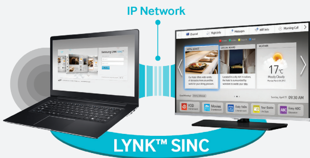
Figure 2. LYNK SINC offers interactive solution for IP hotel infrastructure

Designed exclusively for hospitality businesses to help them manage content and control displays over current RF cables, LYNK™ REACH delivers remote, central and cost-efficient management of in-room displays. LYNK REACH is specialized software provided with LYNK REACH Server for hospitality environments. The software solution provides a simplified UI and editing tool that organizes and displays content, such as hotel information, images and logos, using existing infrastructures. LYNK REACH offers hoteliers advanced advertising functionalities and Channel Bank Management for Pay TV Services. In addition, LYNK REACH improves usability by enabling hotel managers to monitor room status, recent deployment and activity and with a simple, easy and intuitive user interface (UI) through Project Creator.