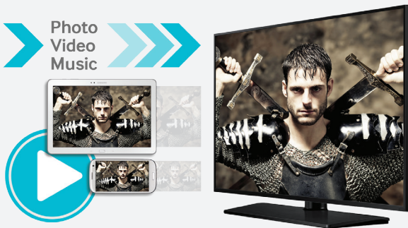
Figure 6. Wireless connectivity enables wide variety of content sharing

Soft AP provides a software access point (AP) or hotspot. Up to four devices can connect wirelessly to the AP. Hotel managers can change the signal level and channel of the Soft AP to suit the connectivity environment of different rooms.