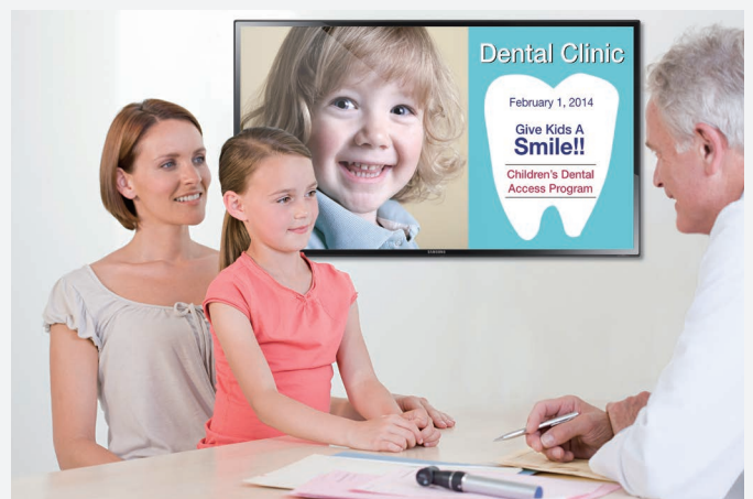
Figure 1. A standalone DBD Series display as a promotional advertising board

DBD Series displays leverage Samsung's new 2nd Generation SSSP with quad-core embedded System on Chip (SoC) to boost power and functionality. 2nd Generation SSSP has twice the processing speed of dual-core displays with a 1GHz quad-core CPU and 1.5 GB double data rate (DDR3) dual 48-bit memory. The DBD Series displays' integrated platform for digital signage eliminates the need for external media players and additional PC units, streamlining the deployment process for time and resource savings. SSSP-enabled DBD Series displays also offer a picture-in-picture (PIP) size over 50 percent of the display, compared to less than 50 percent in dual-core displays.