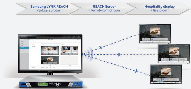
Figure 2. The REACH server allows hoteliers to manage several hundred hospitality displays remotely

The REACH server provides a straightforward way to manage several hundred hospitality displays remotely. This system helps reduce labor costs associated with updating each display individually. The technology also helps reduce total cost of ownership (TCO) because no set-top box (STB) or Internet Protocol (IP) infrastructure is needed.