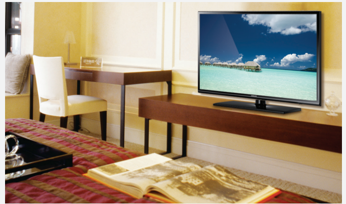
Figure 1. HC470 Series display contributes to a pleasant room ambiance and superior viewing experience with the modern, streamlined design

High-quality displays in guest rooms can contribute to an enjoyable hotel stay. With the modern design of Samsung HC470 Series displays, hoteliers can elevate guests' viewing experience. Light and unobtrusive, the displays feature a narrow bezel, providing more viewing area. Such details bring hotel guests a richer viewing experience and improve the hotel brand.