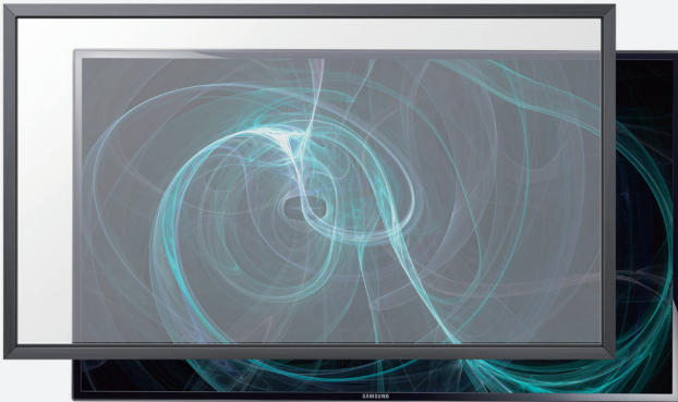
Figure 5. The Touch Module option provides a touch overlay that transforms the display into an interactive touch module

MagicInfo® Premium i Player software works with MagicInfo Server over a network to provide full user management of network devices and content. With the optional SBB-C module, businesses can play a broader range of text and images, including Internet and Really Simple Syndication (RSS) content.