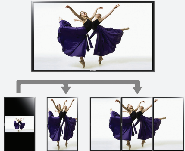
Figure 5. Portrait to landscape image rotation enhances usability with no loss of resolution

Auto Image Rotation enables images to be rotated from landscape to portrait mode to customize the content display. For convenience, two resolution options are available when rotating an image: original resolution and auto full-sizing resolution.