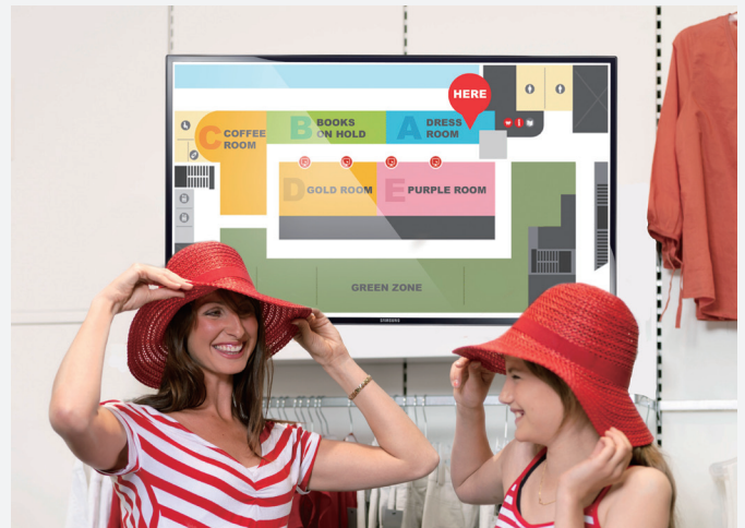
Figure 1. Samsung MEC series displays deliver crisp, clear and bright images

MEC Series displays offer businesses simplified control over exceptional digital messaging