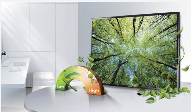
Figure 4. MEC Series edge-type LED LFDs have side-panel lamps for streamlined design and lower operation cost

The LED BLU design enables thinner, lighter-weight displays that occupy less space than conventional LFDs. These LFDs can be installed with ease and placed in myriad configurations using various stand and mount options. Narrow bezels and a sophisticated design reduce distractions.