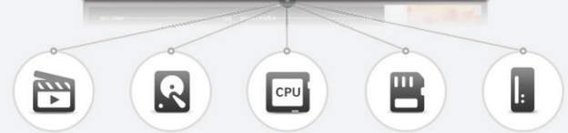
Figure 3. Create, display and manage. All with simple, effortless steps