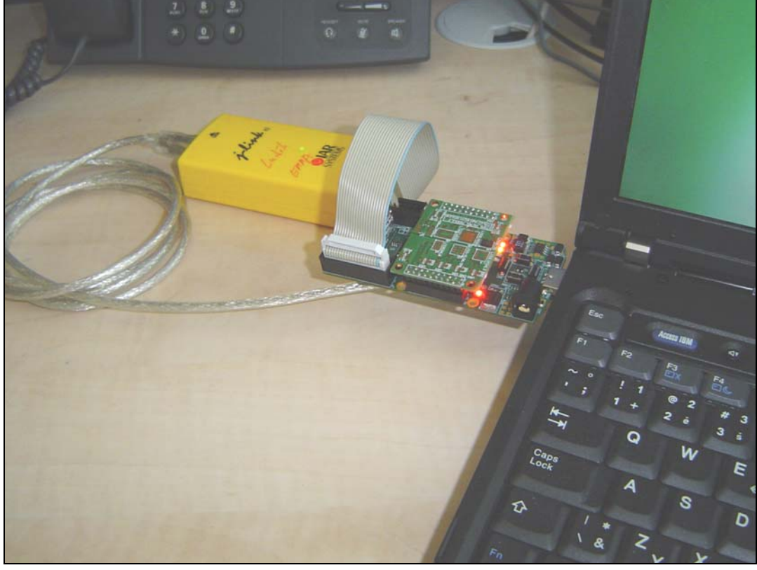
Figure 6. Dongle programming

• Connect IAR J-link to JTAG connector of the dongle