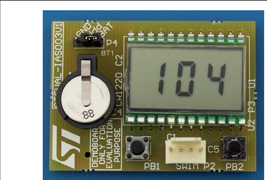
Figure 1. STEVAL-IAS003V1 demonstration board

The board demonstrates the STM8L101xx microcontroller's low power consumption. The demonstration firmware is consequently written to take advantage of the low power modes available on this device. It allows users to achieve average current consumption lower than 1.6 \mu A for the whole application including the direct LCD software driver.