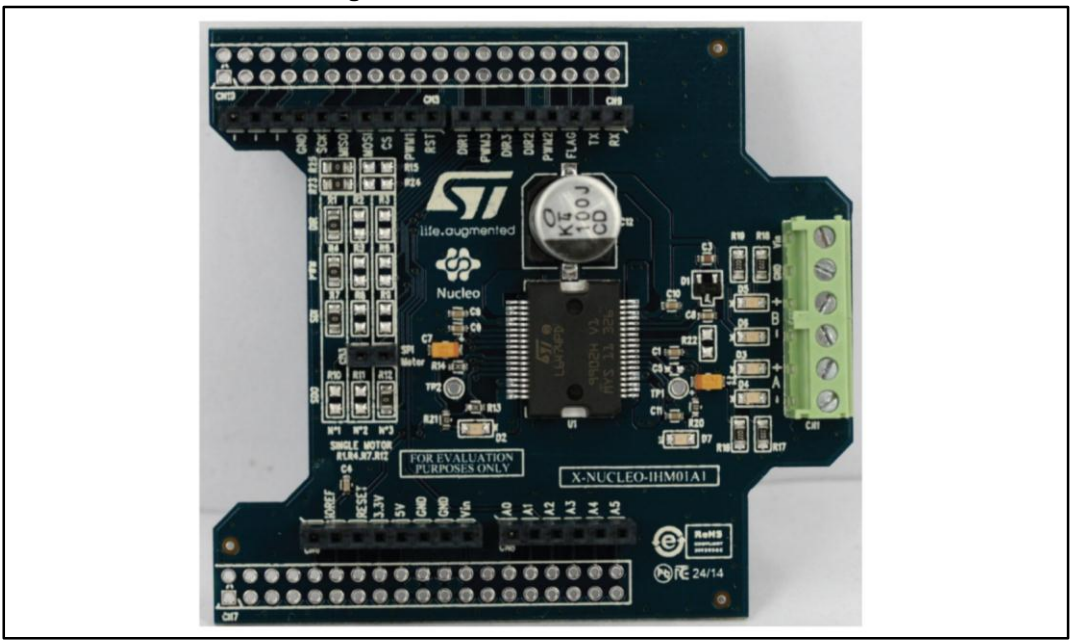
Figure 1: X-NUCLEO-IHM01A1 board

More boards of the same type can be stacked easily to drive up to three stepper motors with a single STM32 Nucleo board.