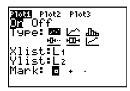
Step 7: You can also make a scatter plot of probabilities versus number of trials. Change Plot1 to match the settings shown at the right.