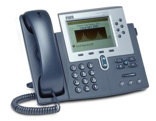
Figure 1. Cisco Unified IP Phone 7960G

The Cisco Unified IP Phone 7960G, a key offering in the IP Phone portfolio, is a full-featured IP phone primarily for manager and executive needs. It provides six programmable line/feature buttons and four interactive soft keys that guide a user through call features and functions. Audio controls for duplex speakerphone, handset and headset. The Cisco Unified IP Phone 7960G also features a large, pixel-based LCD display. The display provides features such as date and time, calling party name, calling party number, and digits dialed. The graphic capability of the display allows for the inclusion of such features as XML (Extensible Markup Language) and future features.