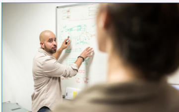
Breaking down information silos across their supply chains

Barilla is giving consumers a great connection to their food. They are also: