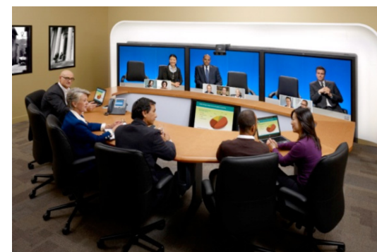
Figure 1. Cisco TelePresence Interoperability