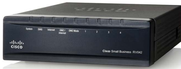
Figure 1. Cisco RV042 Dual WAN VPN Router

To further safeguard your network and data, the Cisco RV042 includes business-class security features and optional cloud-based web filtering. Configuration is a snap, using an intuitive, browser-based device manager and setup wizards.