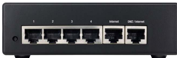
Figure 2. Back Panel of the Cisco RV042

Figure 2 shows the back panel of the Cisco RV042. Figure 3 shows a typical configuration.