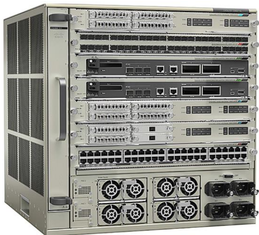
Figure 1. Cisco Catalyst 6807-XL Chassis

The Cisco Catalyst 6807-XL chassis offers integrated resiliency by providing 1+1 supervisor engine redundancy, redundant fans, and N+1 power supply redundancy, thereby limiting network downtime and making sure of workforce productivity, customer satisfaction, and profitability.