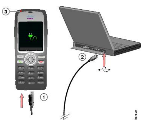
Figure 8: USB cable connecting the phone to a PC

You can use a standard or Cisco USB cable to connect your Cisco Unified Wireless IP Phone 7925G, 7925G-EX, and 7926G to a computer to configure a new phone for the first time or to charge the phone battery. The following figure shows how to connect the phone to a computer.