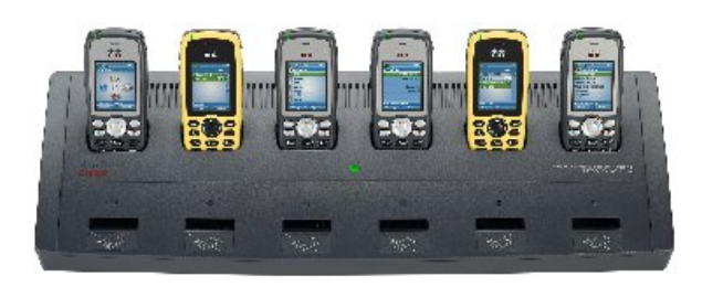
Figure 2: Cisco Unified Wireless IP Phone 7925G Multicharger

For more information, see the Cisco Unified Wireless IP Phone 7925G, 7925G-EX, and 7926G Multicharger Installation Guide.