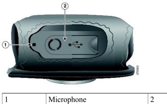
Figure 6: Leather Case Opening for Microphone and Mini-USB Port

The following figure shows the bottom of the phone when in the leather case.