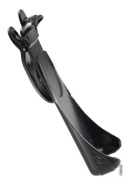
Figure 4: Cisco Unified Wireless IP Phone 7925G Holster Carry Case

The following figure shows the Cisco Unified Wireless IP Phone 7925G Holster Case. The Cisco Unified Wireless IP Phone 7926G Holster Case is similar in appearance, but is shaped differently to accommodate the bar code scanner of the Cisco Unified Wireless IP Phone 7926G.