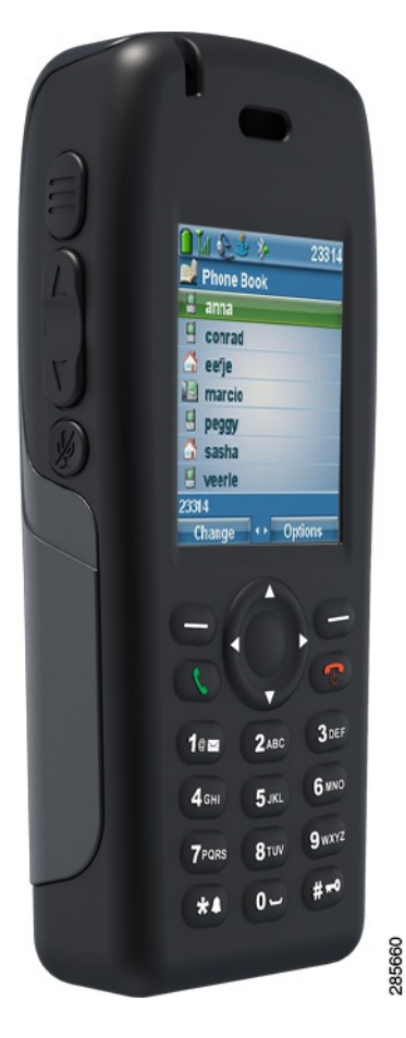
Figure 7: Installed Cisco Unified Wireless IP Phone 7925G Ruggedized Case

Two clips that can attach to the back of case are provided: