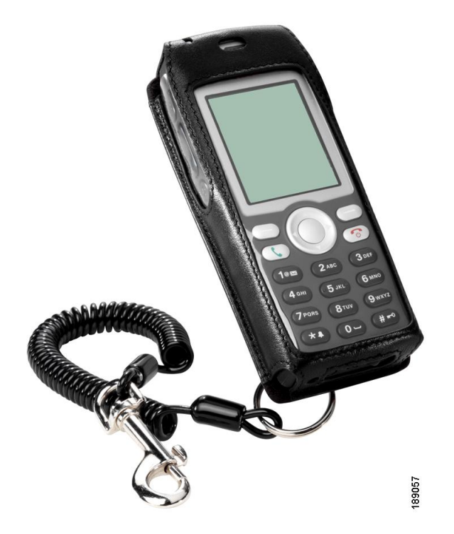
Figure 5: Cisco Unified Wireless IP Phone 7925G Leather Carry Case with Phone

The following figure shows the Cisco Unified Wireless IP Phone 7925G Leather Carry Case. The Cisco Unified Wireless IP Phone 7926G Leather Carry Case is similar, but the bar code scanner of the Cisco Unified Wireless IP Phone 7926G is accessible without removing the case.