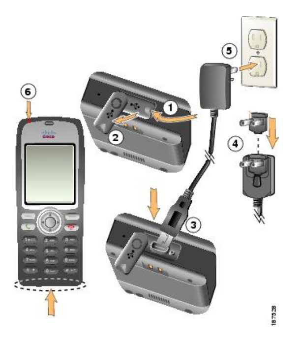
Figure 1: AC Power Supply

The following figure describes how you set up the phone to charge with the AC power supply. The numbers refer to the procedure steps.