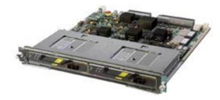
Figure 1. The Cisco 7600 Series/Catalyst 6500 Series Enhanced FlexWAN module

The Cisco<sup>®</sup> 7600 Series/Catalyst<sup>®</sup> 6500 Series Enhanced FlexWAN module (Enhanced FlexWAN) enables high-performance, intelligent metropolitan-area network (MAN) and WAN services. Enterprises and service providers can take advantage of the many types of the Cisco 7000 Series common port adapters for their WAN aggregation and connectivity options, as well as the increased scalability, performance, and rich quality of service (QoS) features offered by the Cisco Enhanced FlexWAN module.