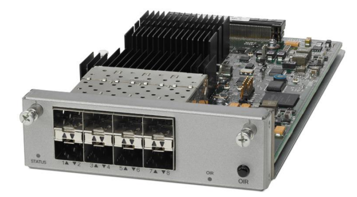
Figure 3. 8 x 10 Gigabit Ethernet Port Uplink Module

In addition, both 32 port and 16 port versions are available with front-to-back and back-to-front airflow. The front-to-back airflow switch comes with matching burgundy color fan and power supply handle to indicate warm side. Similarly, back-to-front airflow switch fan and power supply handles are color-coded in blue to indicate cool side. Figure 5 and Figure 6 show rear view of the switch with front-to-back and back-to-back airflow respectively.