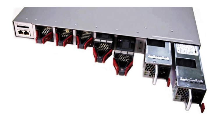
Figure 6. Redundant Fan and Power Supply

Cisco Catalyst 4500-X switch provides redundant hot swappable fans and power supplies (Figure 7) for highest resiliency with no single point of failure.