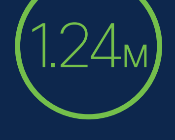
The average cost of a compromise for SMBs in 2019 was $1.24M