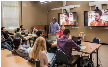
Removed geographical barriers to global learning

mobile devices, making participation very easy for them.”