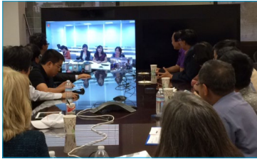
Enabled collaboration-based teaching methods

With digital collaboration technology, San José State University: