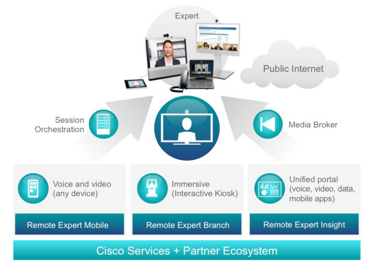
Figure 1. Cisco Virtual Expertise: A Consistant Experience with Experts Anywhere, on Any Device

The Virtual Expertise business offer delivers a consistent, interactive experience that increases upsell/cross sell, improve expert productivity, and increases customer loyalty. The Cisco Virtual Expertise business offer consists of Cisco Remote Expert Mobile and Branch components combined with professional services to speed successful design and deployment. Cisco Remote Expert creates a virtual pool of specialists, manages their availability, and quickly connects customers through visual, selfservice choices on their smart phones. tablets, laptops, and PCs with experts across multiple channels and devices. using high-quality audio and video.