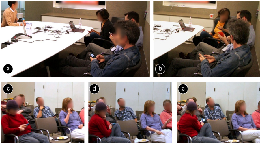
Figure 3. Review of content facilitated small-group discussions in ad-hoc F-formations: side-by-side (a–b) and L-shaped (c–e).

L-shaped formation to discuss content around the slides available on the phone (Figures 3c–e). In both cases, the formations, afforded by the micro-mobility of smartphones [9], were ad-hoc and short-lived, quickly emerging out and merging back into the ecosystem.