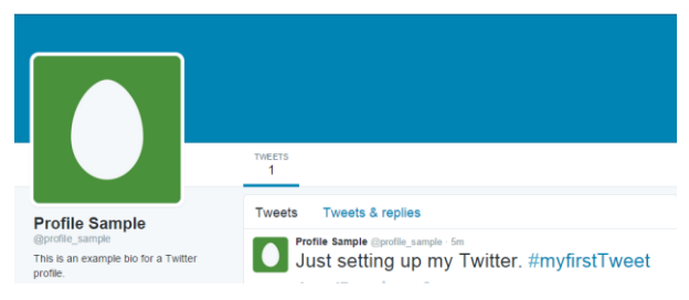
Figure 1. This sample Twitter profile page uses the default profile image (an egg) and the default header image (a solid blue rectangle). The user's Twitter handle appears below the profile image, followed by the bio .