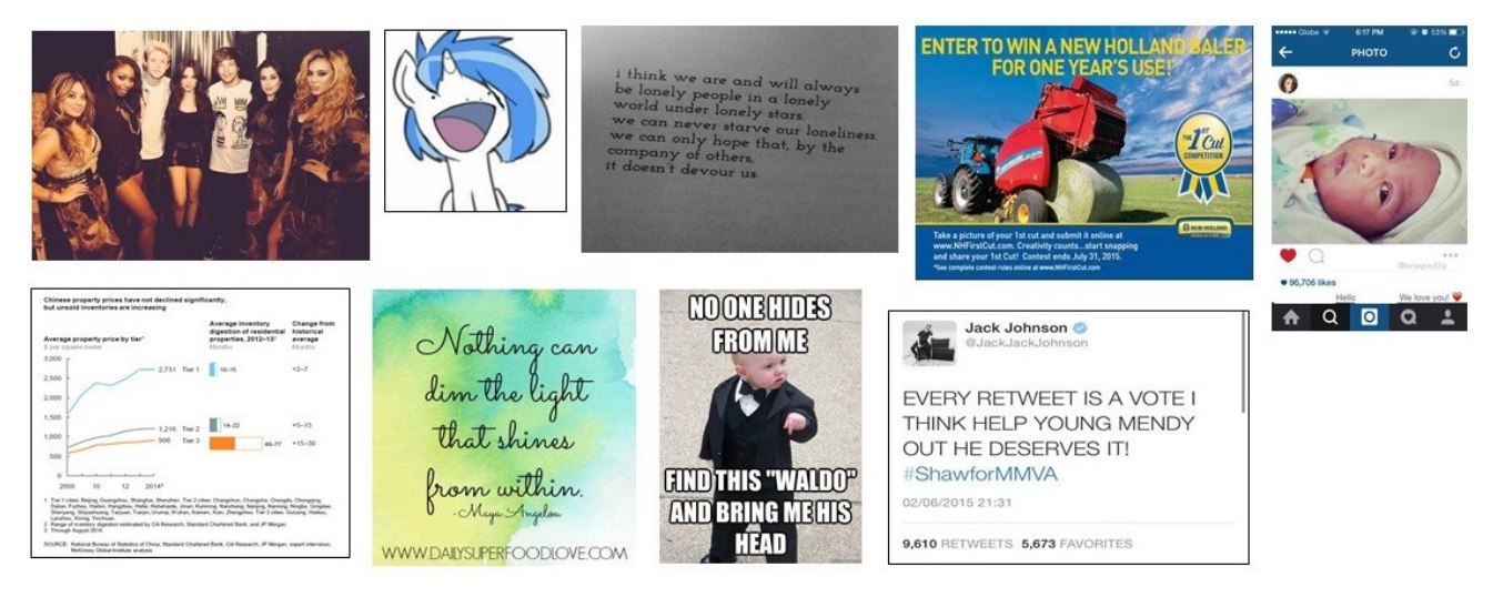
Figure 3. Nine types of imagery commonly embedded in tweets. Top row: photograph; drawing; picture of text ("screenshort"); image with embedded text; screenshot. Bottom row: graph; inspirational quote; meme, unofficial retweet.