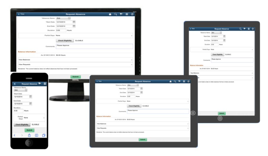
Simple and accessible on any device