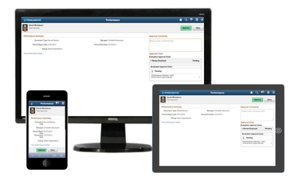
Simple, intuitive user experience on any device