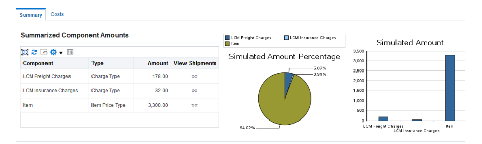
Figure 2. Landed Cost Simulation for a Purchase Order.

Next, charge simulations are carried forward into the estimated landed costs during the receiving process. These values update the inventory value, in addition to Oracle Financials, and get revised as actual charge invoices are validated. Early estimation and accounting provides insight into additional charges, fees and taxes that were not typically known until well after invoices were received. Furthermore, Oracle Landed Cost Management automatically allocates the charges back to the individual product responsible for them, not just to the high level parent product or category, allowing organizations to gain insight into this product specific information. Additionally, it gives users the opportunity to perfect the sourcing process and correct cash flow plans by following up the variances from estimated to actual landed costs.