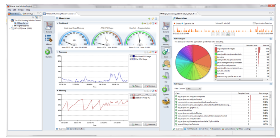
Figure 1: Java Mission Control