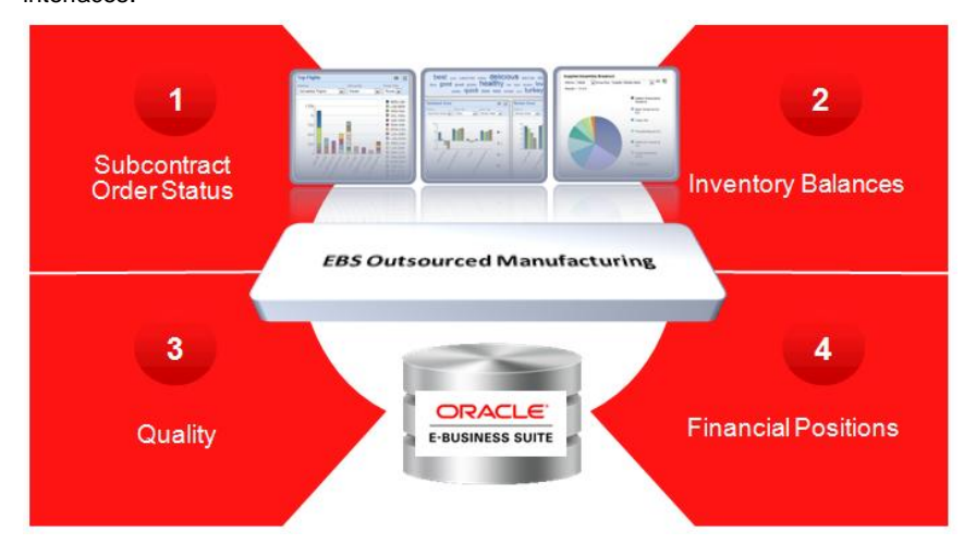
Figure 2. Outsourced Manufacturing Data discovery domain.

A business user can access complete and real-time visibility into the overall health of the outsourced manufacturing business using the rich user interface powered by Endeca. Various aspects of the business such as subcontracting order status, inventory balances, financial position, and quality issues can be visualized intuitively using these interfaces.