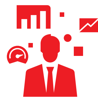
Breadth and Depth of Enterprise Level Context Models