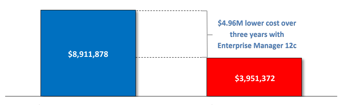
Figure 1. Three-Year Management Cost Comparison with vs. without Oracle EM 12c ($1B Organization with 80 Oracle WebLogic Servers and Oracle SOA Deployments)