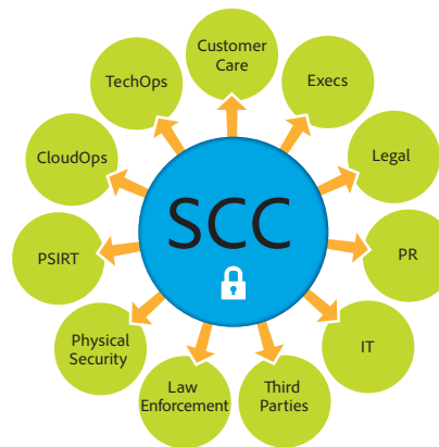
Figure 1: The Adobe Security Coordination Center (SCC) works with internal and external stakeholders to continuously improve the company's security posture and maturity.

The SCC is a centralized group within Adobe that consists of the Adobe Security Operations Center (SOC), which handles monitoring and alerting, a threat intelligence team, and an incident response (IR) team. These teams work together and with other stakeholders within and outside of Adobe to drive the prevention and early detection of security incidents as well as to continuously improve the company's security posture and maturity. The threat intelligence team focuses on threat actors and methodologies, while the SOC team handles alerts and the triage thereof. Once an alert hits specific incident triggers, the incident response team takes over investigation and mitigation of the incident. The SCC also curates and shares vetted security intelligence to appropriate groups across the organization, to ensure that employees within Adobe benefit from the knowledge learned from incidents.