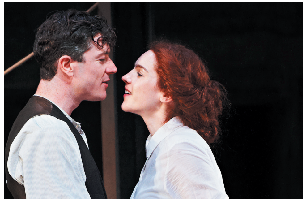
The Plough and the Stars