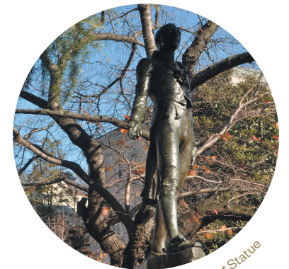
Robert Emmet Statue