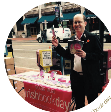
The Solas Nua book day

www.cultureireland.ie/jamireland www.webanjo3.com