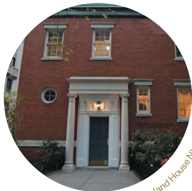
Glucksman Ireland House NYU symposium

http://universityseminars.columbia.edu/seminars/irish-studies/