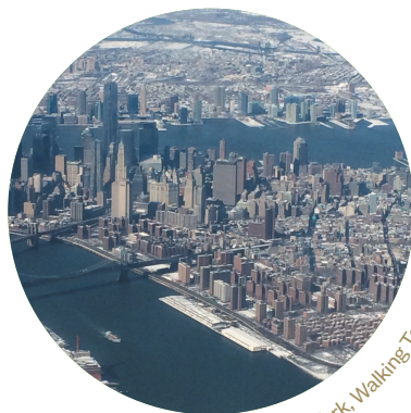
Irish in New York Walking Tour

www.cultureireland.ie/jamireland www.newyorklivearts.org www.arcanecollective.com