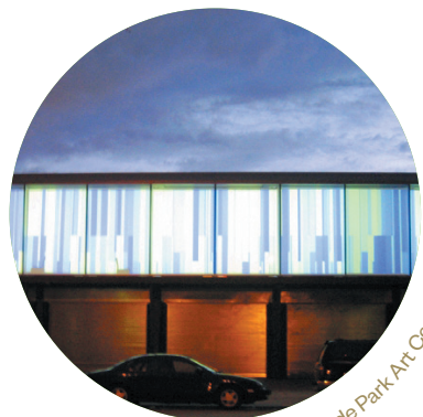
(Re)Public, Hyde Park Art Centre