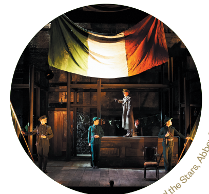
The Plough and the Stars, Abbey Theatre