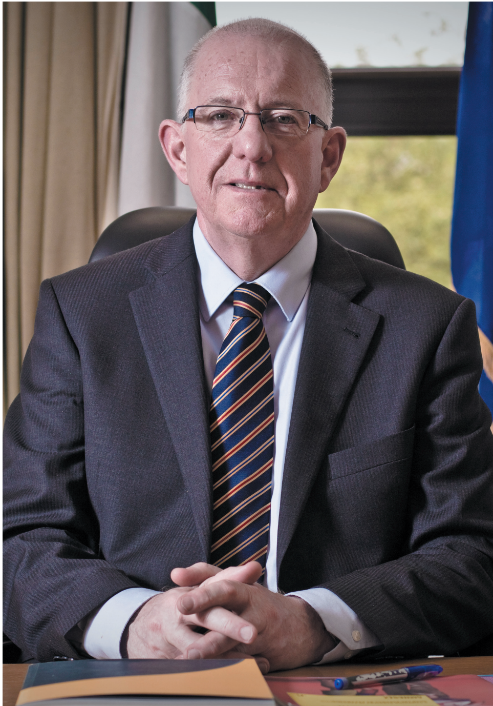
Charlie Flanagan TD, Minister for Foreign Affairs and Trade