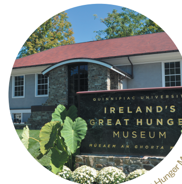
Ireland's Great Hunger Museum