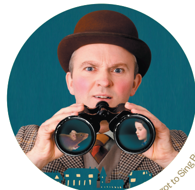
The Girl who Forgot to Sing Badly

www.cultureireland.ie/iamireland www.thewallis.org www.theatrelovett.com