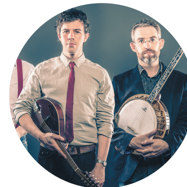
We Banjo 3

By US Representative Richard E. Neal. Further details TBA.