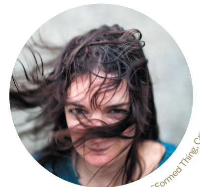
A Girl is a Half-Formed Thing.

www.cultureireland.ie/jamirelan www.irishartscenter.org www.bacnyc.org