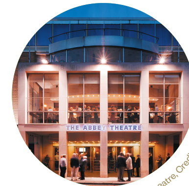
The Abbey Theatre