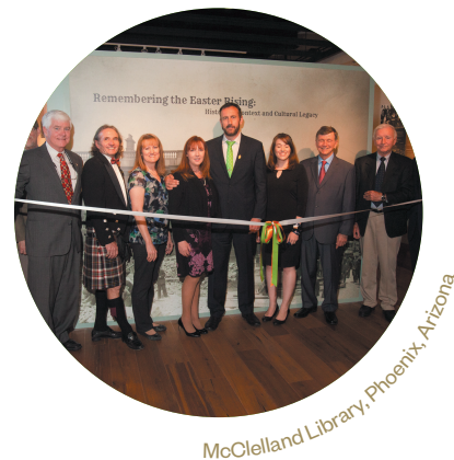
McClelland Library, Phoenix, Arizona

www.azirishlibrary.org/1916-commemoration-series/