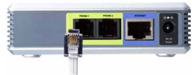
Figure 3-2: Connect the RJ-11 Telephone Cable

IMPORTANT: Do not connect either of the Phone ports to a telephone wall jack. Make sure you only connect a telephone or fax machine to either of the Phone ports. Otherwise, the Phone Adapter or the telephone wiring in your home or office may be damaged.