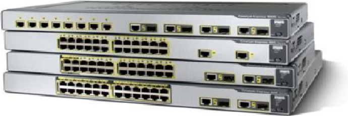
Figure 1. Cisco Catalyst Express 500 Series Switches

Figure 2 shows typical Cisco Catalyst Express 500 Series Switch deployment scenarios.